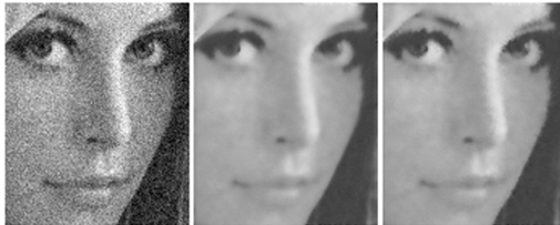
Fig. 3. TEST2: Left: Noisy image ( \sigma = 0.005 ), Middle: Isotropic NLM algorithm, Right: Proposed algorithm