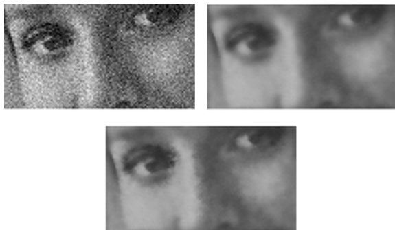
Fig. 4. TEST4: Top: Noisy image ( \sigma = 0.005 ), Middle: Isotropic NLM algorithm, Bottom: Proposed algorithm

adapting the size, shape, and orientation of the weighing function in an anisotropic manner based on the perceptual characteristics of the underlying image content, it was shown that noticeably improved perceptual quality can be achieved over the existing isotropic non-local means denoising algorithm. Future work includes investigating alternative objective measures for perceptual significance as well as different weighing functions.