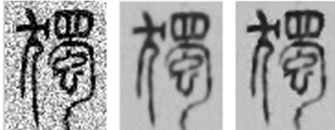
Fig. 2. TEST3: Left: Noisy image ( \sigma = 0.005 ), Middle: Isotropic NLM algorithm, Right: Proposed algorithm